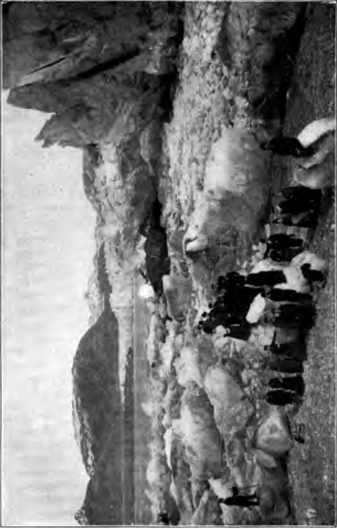
THE MUIR GLACIER IN THE SEVENTIES, SHOWING ICE CLIFFS AND STRANDED ICEBERGS